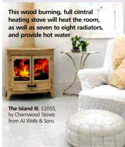
The Island III, £2055, by Charnwood Stoves from AJ Wells & Sons

This wood burning, full central heating stove will heat the room, as well as seven to eight radiators, and provide hot water