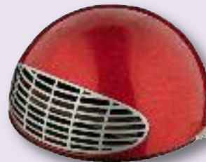
Domed fan heater in red or silver, £29.99, John Lewis

► The Italian-designed stylish 2kW domed fan heater is easy to store away when not in use