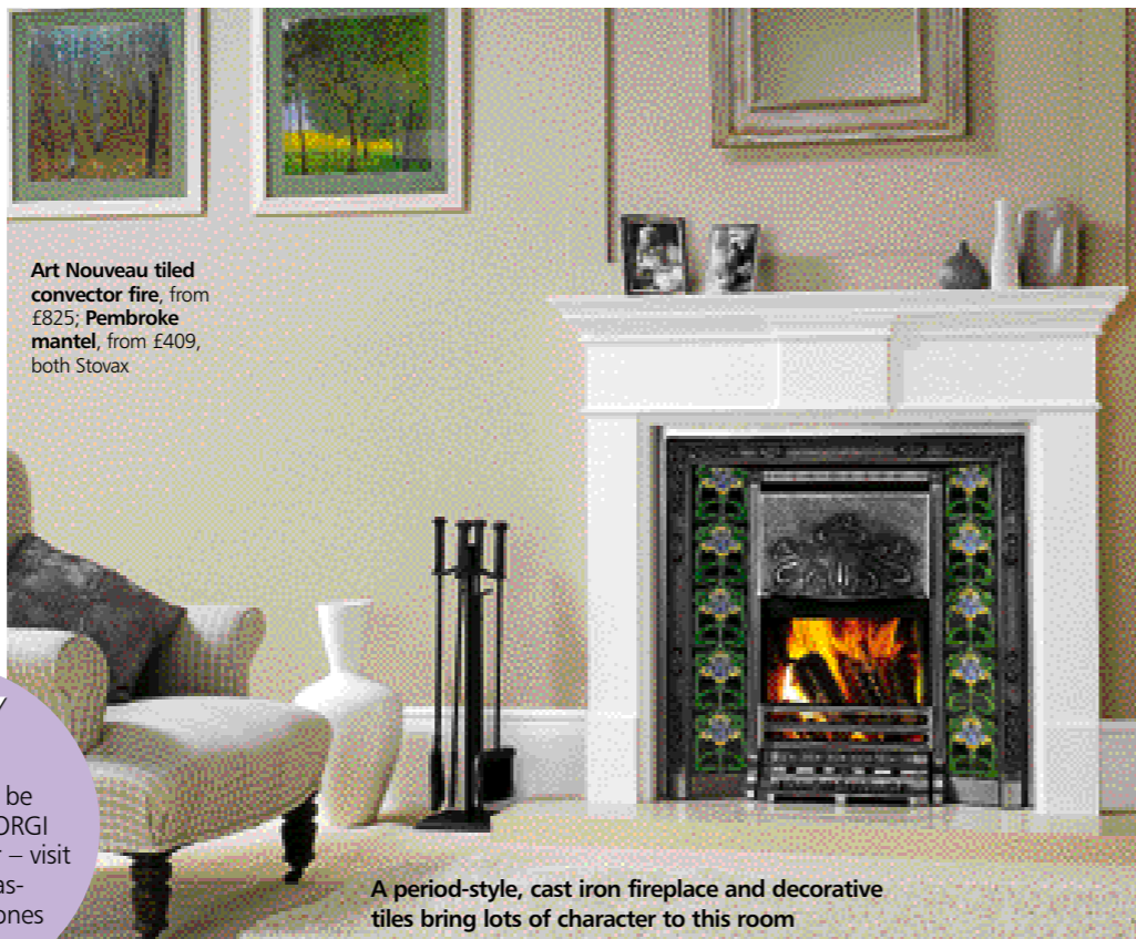
Art Nouveau tiled convector fire, from £825; Pembroke mantel, from £409, both Stovax

Gas fires must be installed by a CORGI registered installer – visit www.corgi-gas-safety.com for ones in your area.