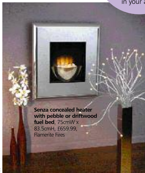
Senza concealed heater with pebble or driftwood fuel bed, 75cmW x 83.5cmH, £659.99, Flamerite Fires

▲ This fire can be wall-mounted or inset into the wall. It has multi-function remote control, including dimmer, and also offers a flame-only setting