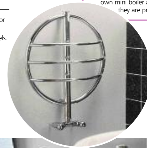
Disq 1 chrome plated ring hydronic towel rail, £239, B&Q

► This circular towel rail has widely spaced rails, ideal for larger towels