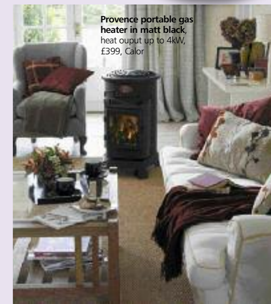
Provence portable gas heater in matt black, heat output up to 4kW, £399, Calor

▲ The Provence gas portable heater has a built-in catalytic converter to eliminate CO 2 emissions, so it's environmentally-friendly