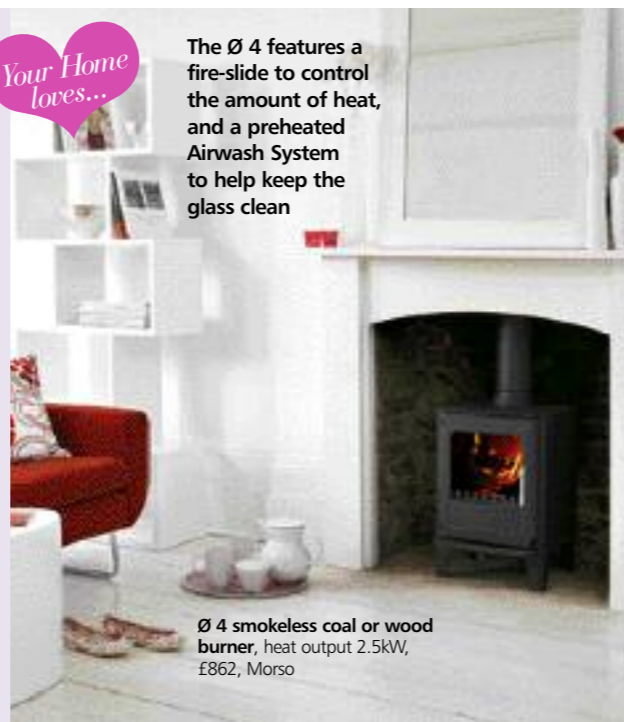
Ø 4 smokeless coal or wood burner, heat output 2.5kW, £862, Morso

The Ø 4 features a fire-slide to control the amount of heat, and a preheated Airwash System to help keep the glass clean